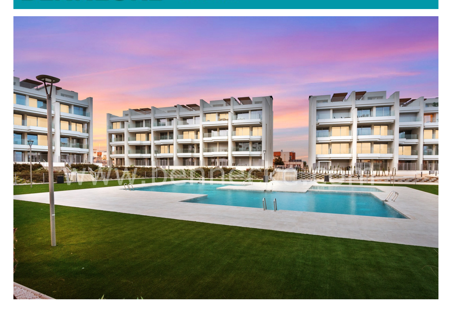
Penthouse in exclusive complex in Villamartín - 7040 € 495.000