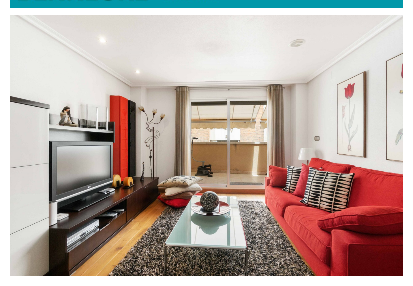
Spacious penthouse in Torrevieja - 4077 € 289.000