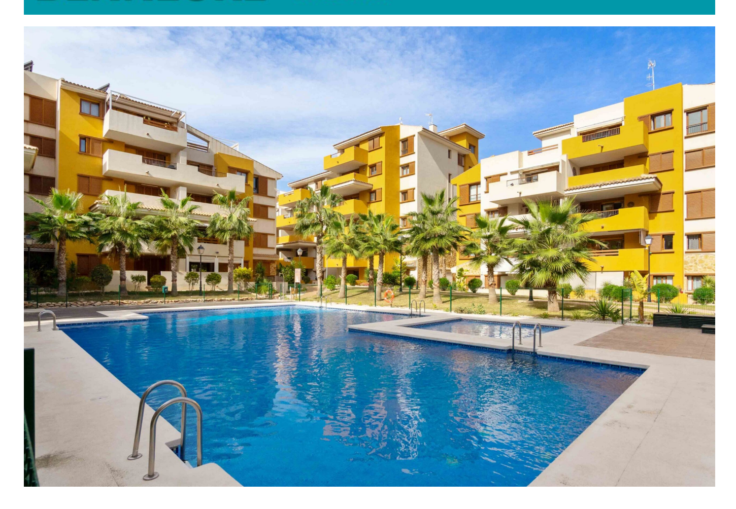
Spacious apartment in La Recoleta, Punta Prima - 4111RV € 365.500