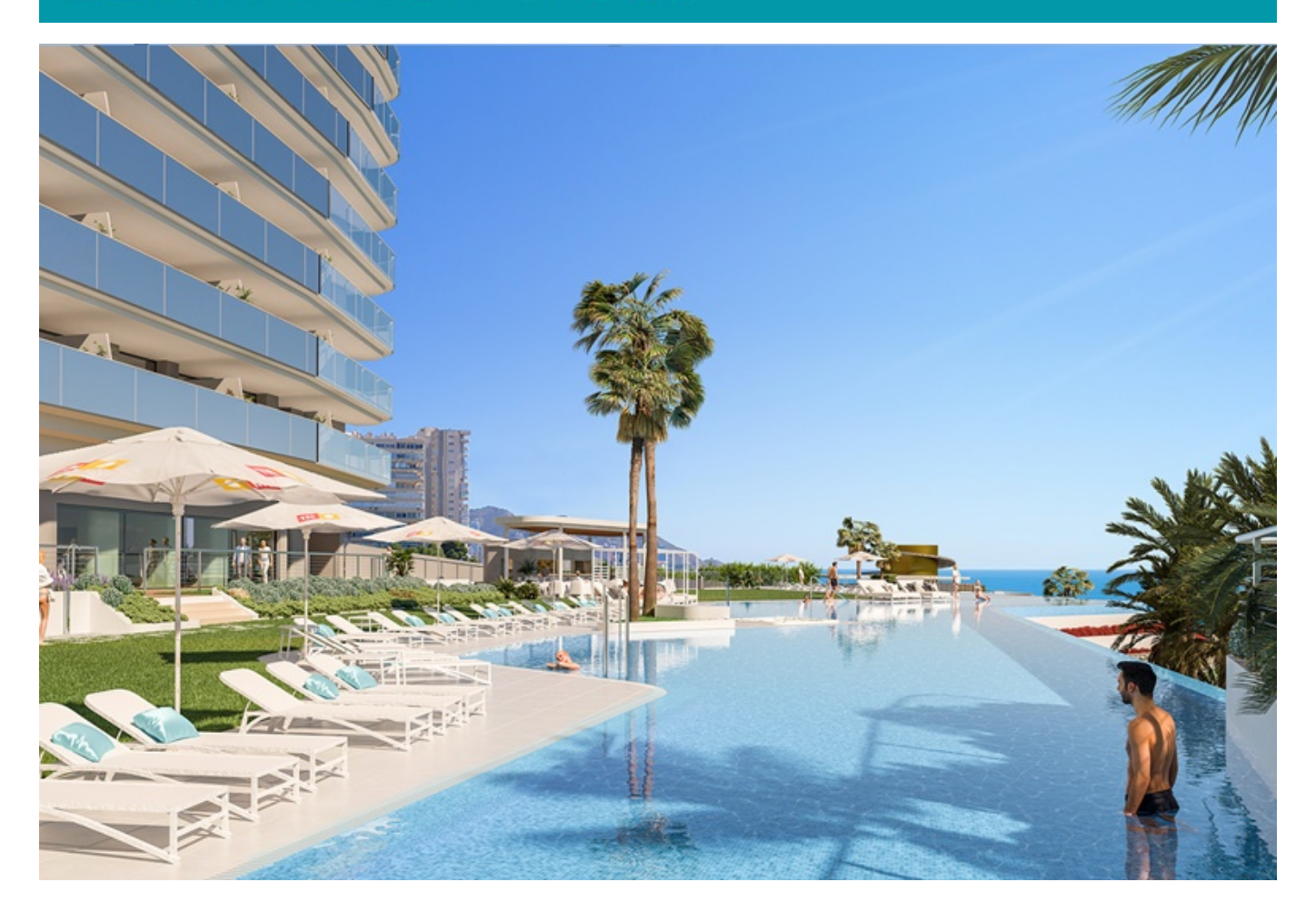
First line apartment in Benidorm, Alicante - 3623 € 543.000